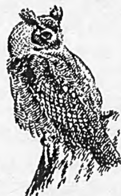
Great horned owl

Moving on to the nightjars and owls, we were treated to the call of the Whippoorwill—and realised how it got its name! Owls we don't see here include the Snowy Owl which breeds on the ground in the tundra, and is only seen on southern Quebec in winter; the Eastern Screech Owl whose call resembled a horse neighing; the Great Horned Owl and the Long-eared Owl, the latter living in forests. Barred Owls and Saw-whet Owls appeared, and one of the largest owls, the Great Grey Owl. It lives in the northern forests and is totally adapted to hunting voles beneath the snow, hearing their tunneling noises and gliding silently to the snow surface, plunging face down while the talons penetrate the tunnel and fasten upon the vole.